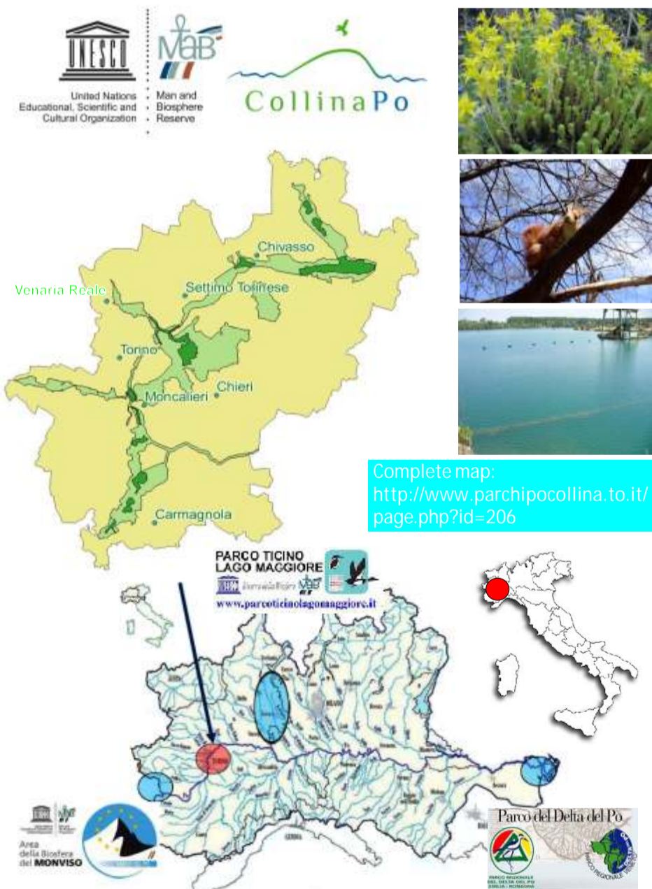
CollinaPo and the network of the Po river biosphere reserves

Conservation: they contribute to the conservation of the landscapes and the ecosystem, the conservation of the species and the genetic variation. Development: they incentive and promote the sustainable development of the local population and its activities. Logistic support: they provide support for demonstration, educational, training and research and monitoring projects on conservation and sustainable development issues.